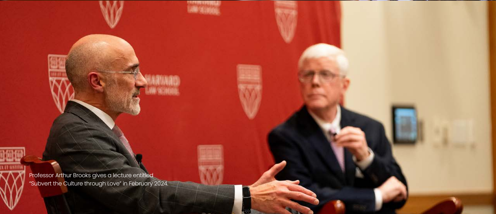
Professor Arthur Brooks gives a lecture entitled "Subvert the Culture through Love" in February 2024.