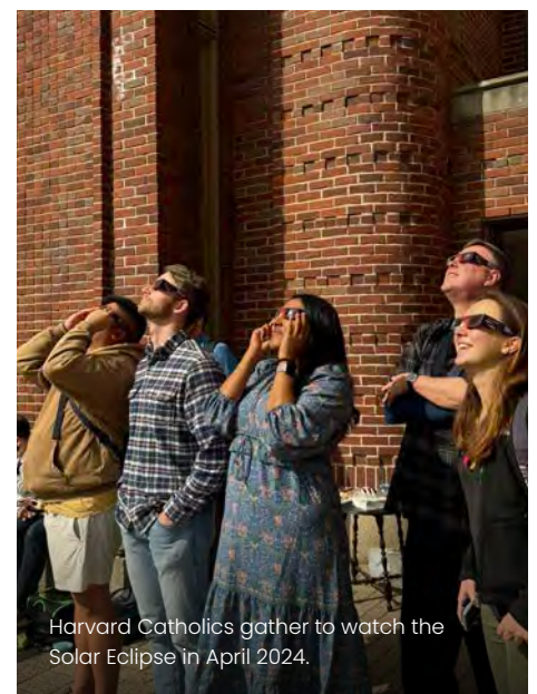
Harvard Catholics gather to watch the Solar Eclipse in April 2024.