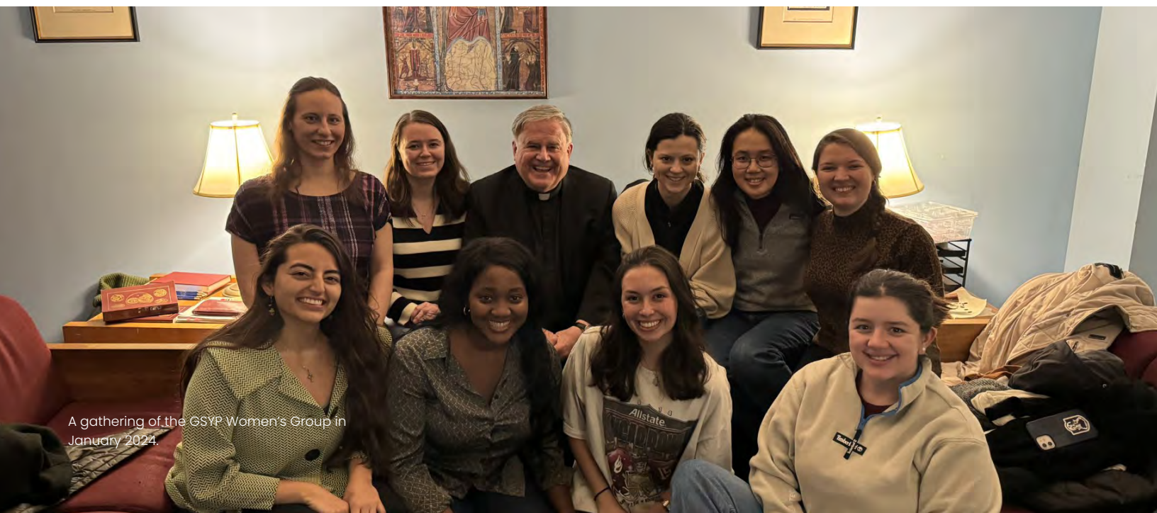
A gathering of the GSYF Women's Group in January 2024.