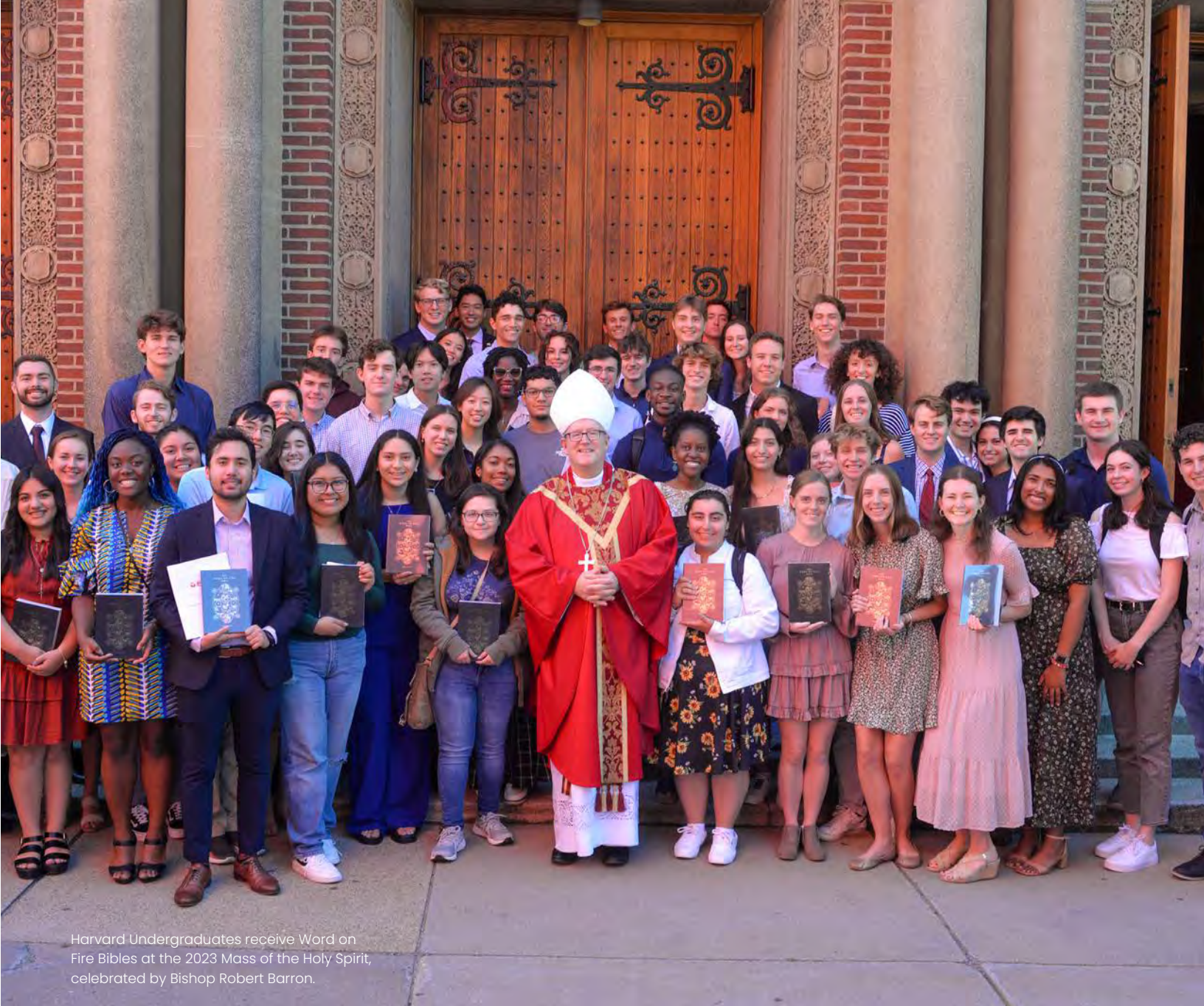
Harvard Undergraduates receive Word on Fire Bibles at the 2023 Mass of the Holy Spirit, celebrated by Bishop Robert Barron.