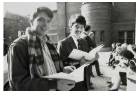
Students celebrate the opening of the new Catholic Center in 1991.

It's hard not to bring the rich experiences I had as an undergrad to my work now, while remembering the pastoral aphorism that "I was never your age," since so many contextual elements have changed radically over the intervening three decades. One of the most helpful things was to remember the various ways Harvard students engaged their Catholic faith. Some were daily Mass goers and prayer warriors, others came for the community and friendships, many were involved for the organized service opportunities, and others came to