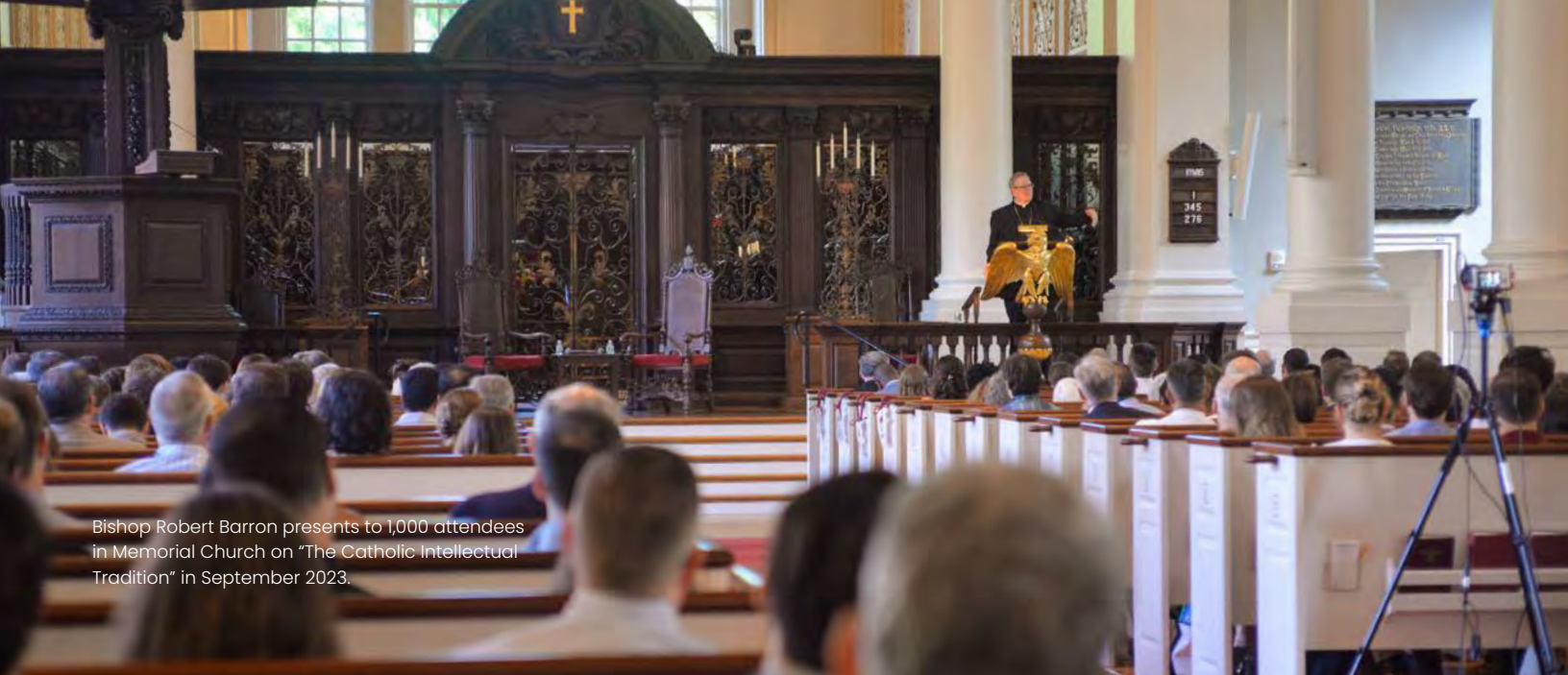
Bishop Robert Barron presents to 1,000 attendees in Memorial Church on "The Catholic Intellectual Tradition" in September 2023.